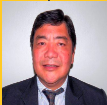
PDS Abo Gempesaw